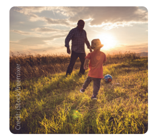
MAKING YOUR PLAN

How establishing LPAs can make things simpler for your loved ones